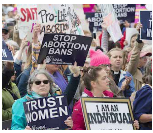
abortion restrictions proliferate, protesters around the country are making their voices heard.

When considering the constitutionality of these new laws, I start with the premise that the current Court is likely to use any abortion case, not just the bans on abortion, to give states the ability to recriminalize abortion. Why am I so pessimistic? First and foremost, the Supreme Court today is more conservative than in 1992 and Chief Justice Roberts, unlike Justice Kennedy, has shown his willingness to overturn precedent if five members of the Court disagree with the initial basis for the decision. Just this term, he joined the opinion of the Court in Franchise Tax Board of California v. Hyatt, in which